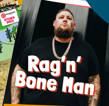
Rag'n' Bone Man